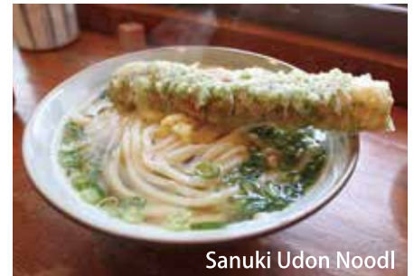
Sanuki Udon Noodle